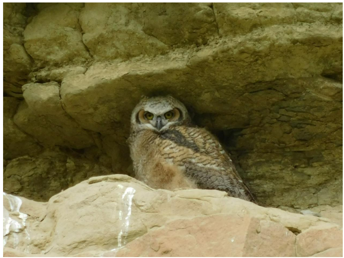
A resident of the Pillar, Great Horned Owl