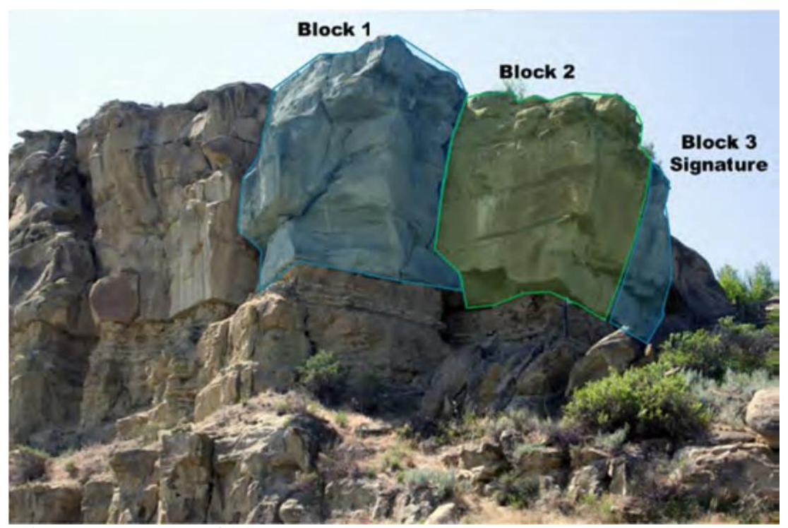
References to Block Names 1,2,3 at Pompeys Pillar