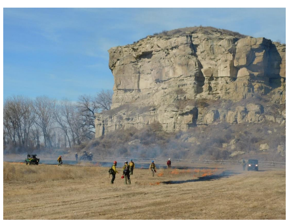
Prescribed Fire at Pompeys Pillar National Monument