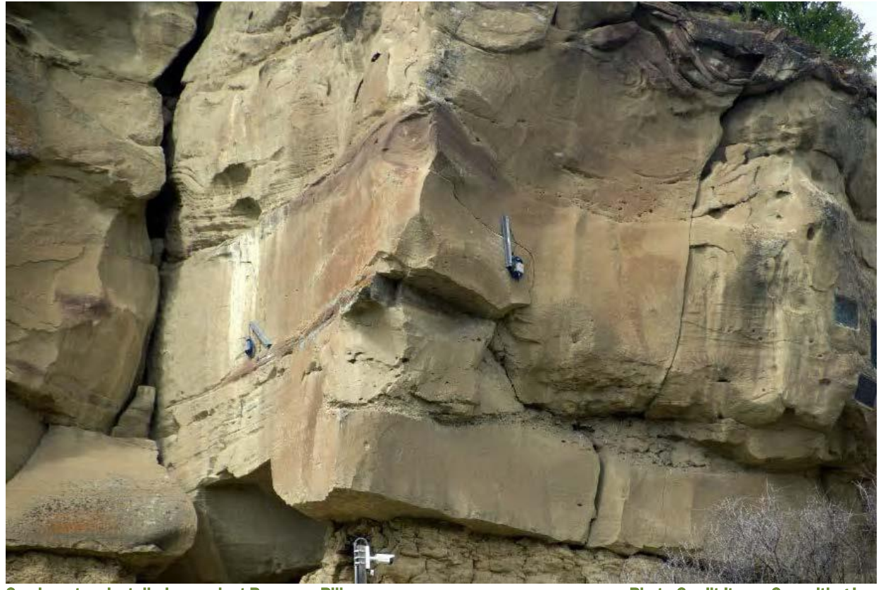
Crack meters installed on rock at Pompeys Pillar