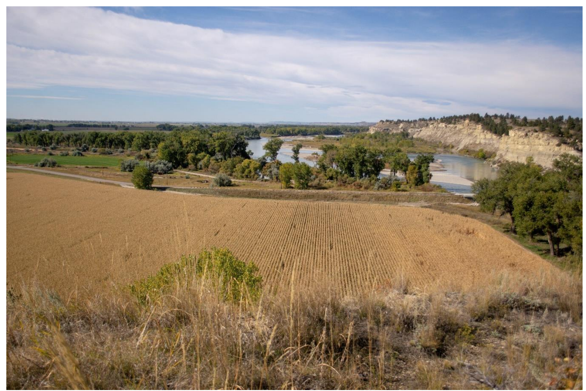
Looking west atop Pompeys Pillar with the Yellowstone River in view