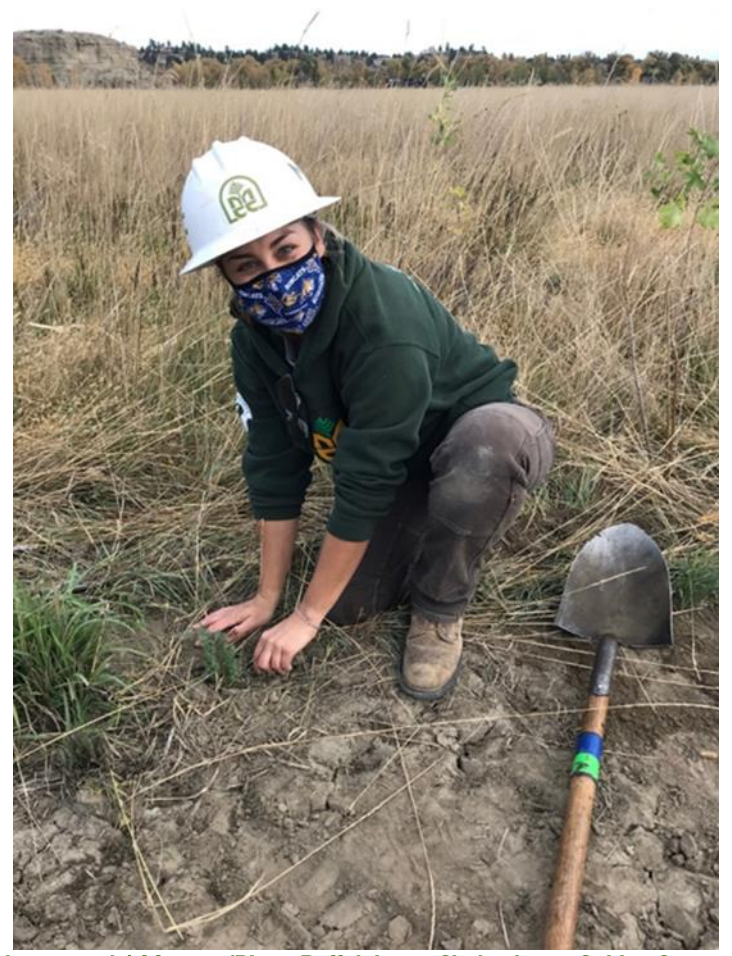
MCC crew planted and protected 144 trees (Plum, Buffaloberry, Chokecherry, Golden Currant and Rocky Mountain Juniper) and 96 grasses (Basin Wildrye, and Blue bunch Wheatgrass) on the ACEC as part of Montana's Upland Game Bird Enhancement Program.

We continue working with Montana Fish Wildlife and Parks, Pheasants Forever, and Habitat Forever partners to improve wildlife habitat and hunting opportunities for the public within the ACEC at PPNM. This year the Billings Field Office developed a 4-year Vegetation Management Plan for Pompeys Pillar ACEC (2020–2023). The following vision statement was developed: "Provide safe opportunities for current and future visitors to the BLM land around Pompey's Pillar for hunting and hiking, while protecting the natural visual characteristics and native flora and fauna along the Lewis and Clark National Historical Trail corridor and around Pompey's Pillar."