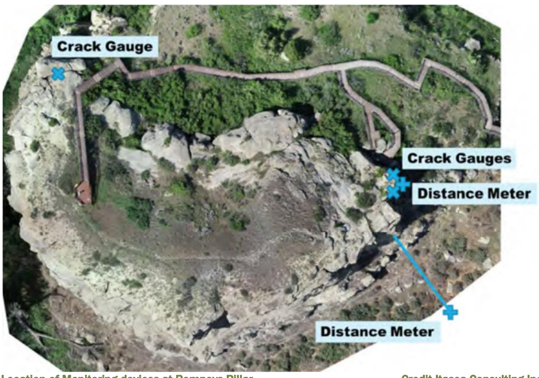
Location of Monitoring devices at Pompeys Pillar