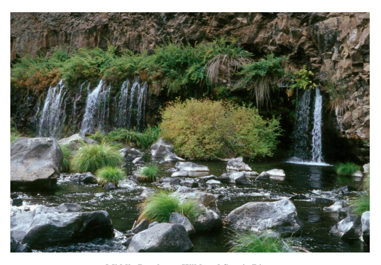
Middle Deschutes Wild and Scenic River