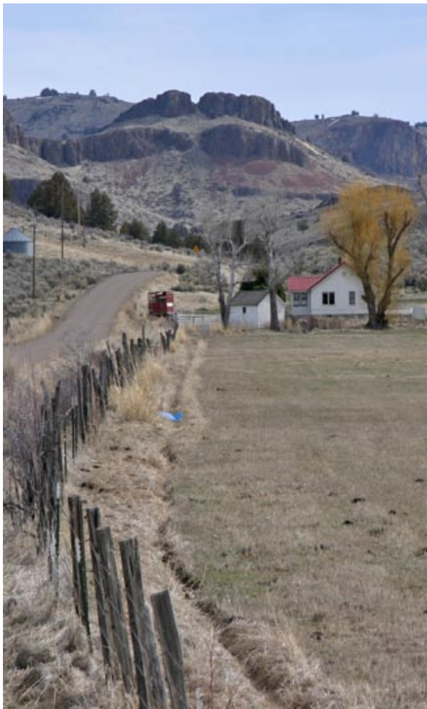
The Byway east of Jordan Valley, Oregon