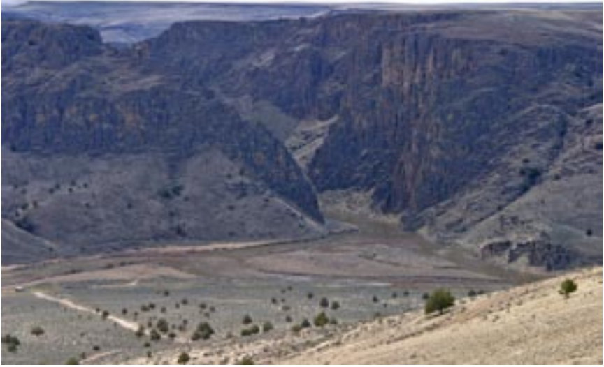
Three Forks from the overlook

25.6 miles (Mile 78.9) - Private water impoundments like Dougal Reservoir provide habitat for a variety of waterfowl including Canada geese, tundra swans, western grebes, and many species of ducks. The area around here is a mix of public and private land, and there is no public motor vehicle access to the reservoir off of the Byway.