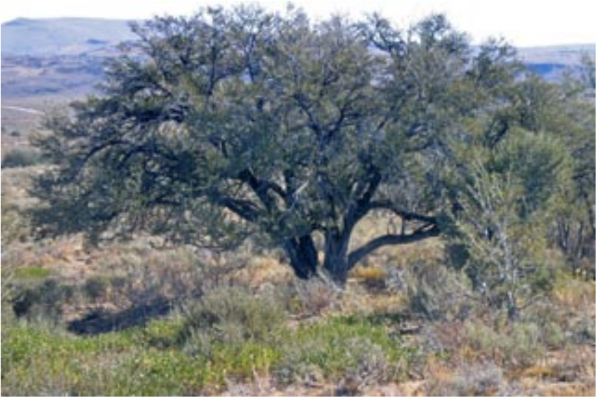
Curleaf Mountain Mahogany