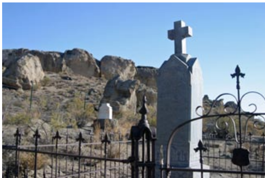
Turmes Family Cemetery