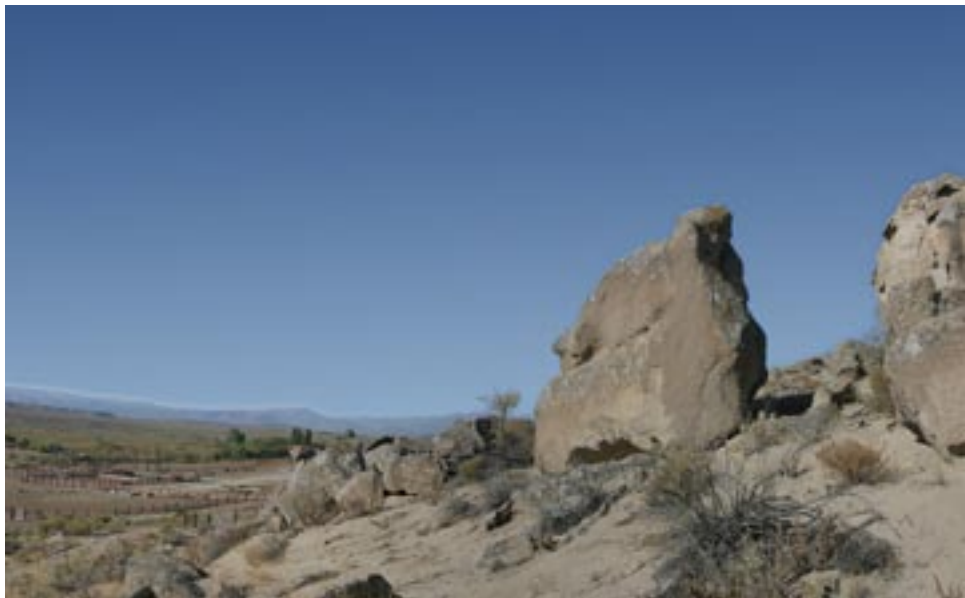
Limestone remnants of Lake Idaho

94.2 miles (Mile 10.3) - The limestone hills off to your left are deposits from ancient Lake Idaho, a Lake Ontario-sized series of lakes that stretched from present-day Twin Falls, Idaho, to Baker, Oregon, and filled the valley from the Boise Front to the Owyhee foothills with thick layers of ash, clay, silt, sand, limestone and gravel. Fossilized plants, fish, clams, snails, and mammal bones are common in these old lake sediments.