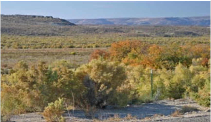
Salt Desert Shrub

The salt desert shrub habitat is generally more open than sagebrush dominated habitats, with larger spaces between shrubs and bunchgrasses. It provides habitat for several special status migratory songbirds such as the loggerhead shrike, sage sparrow, and black-throated sparrow.