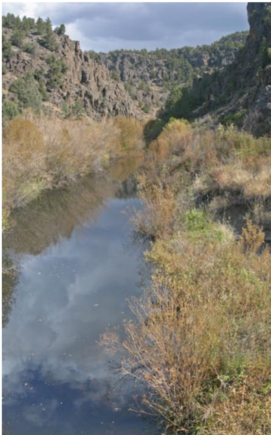
North Fork of the Owyhee River