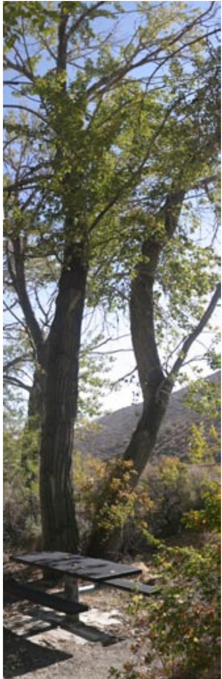
Poison Creek Picnic Area

Cross an expansive salt desert shrub landscape. Salt desert shrub habitat occurs in areas that have very low precipitation (less than 10"). The soils are commonly sandy or saline.