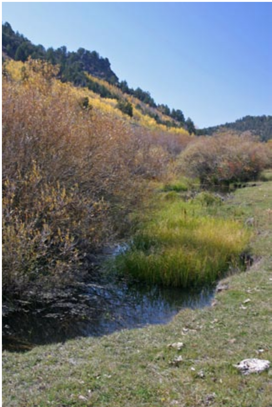
Beaver Dams at Stoneman Creek