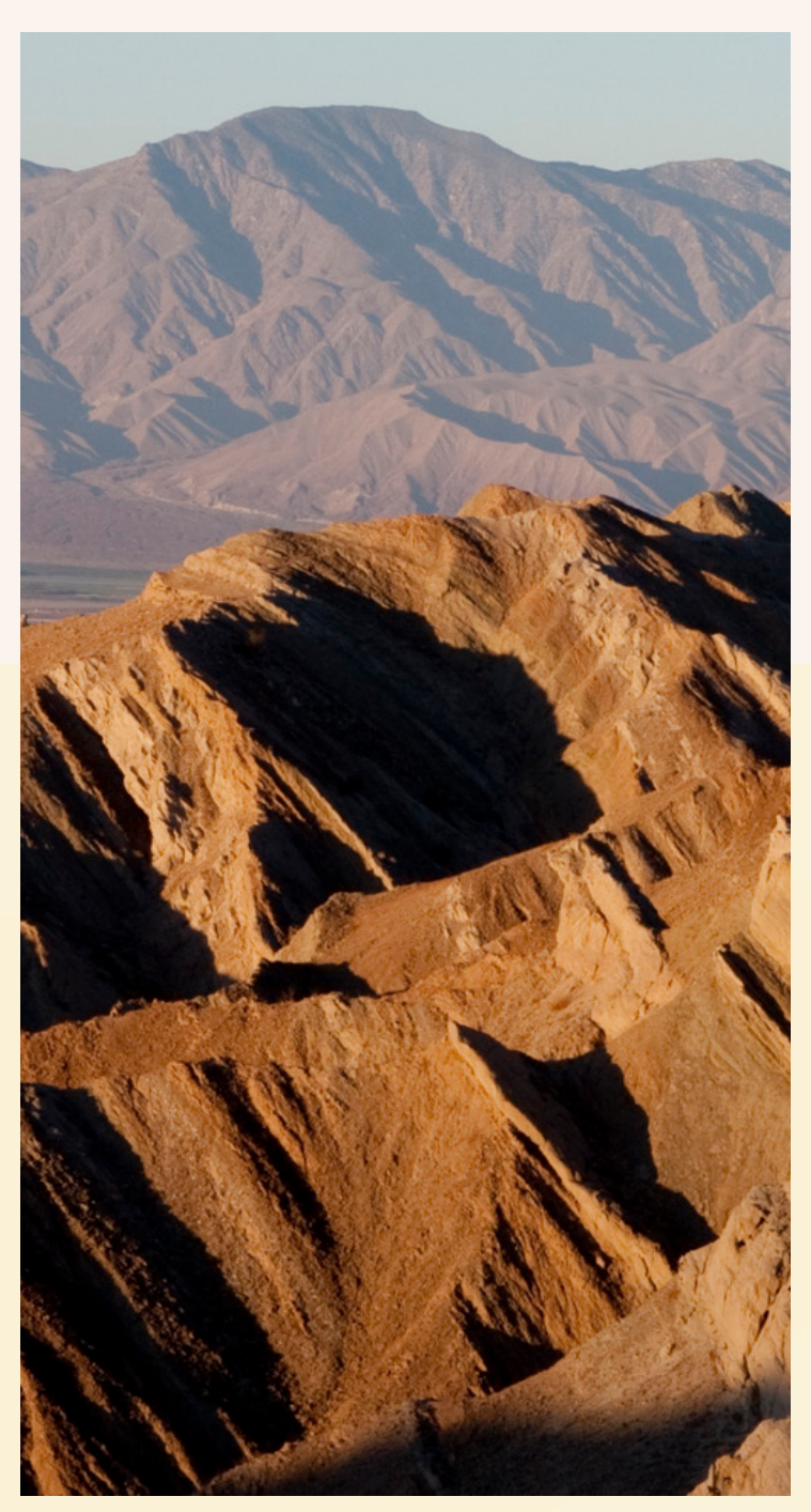
Santa Rosa Wilderness, Palm Springs-South Coast Field Office

For more information about your public lands, subscribe to News.Bytes, BLM California's weekly e-newsletter by emailing us at BLM_CA_NewsBytes@blm.gov. Or follow us on Facebook @BLMcalifornia or X (formerlyTwitter)@BLMca!