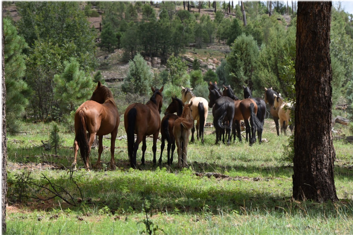
Horses on the Sitgreaves NF