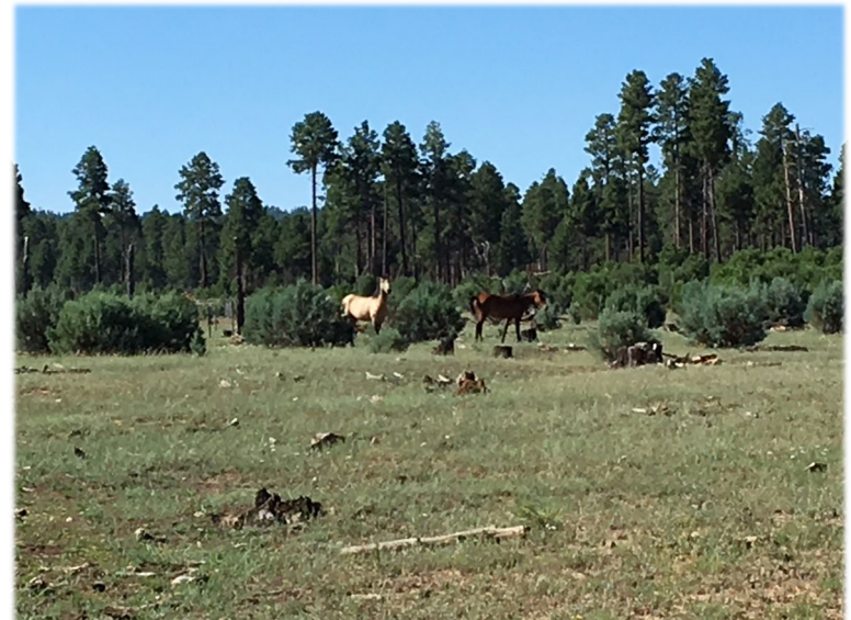
Two horses on the Sitgreaves NF