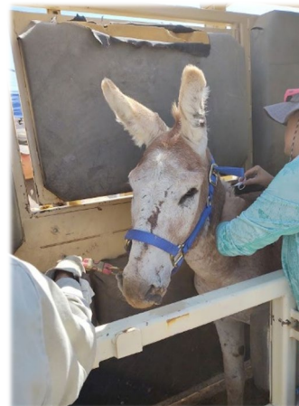
Burro in a chute