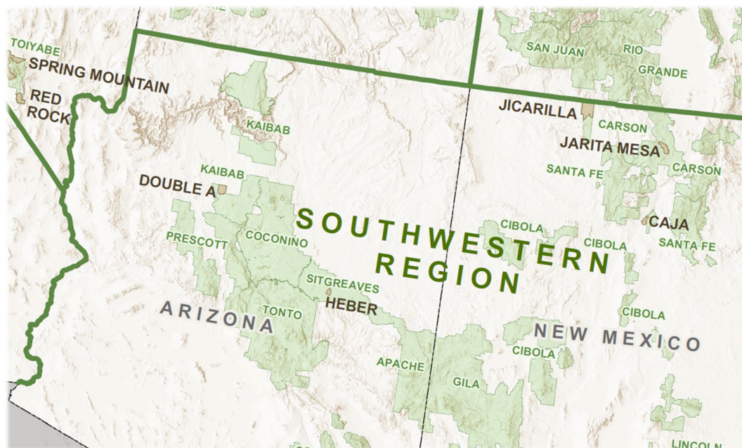
Map of AZ and NM showing National Forest Service lands and associated Horse or Burro Territory