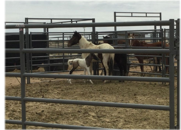
Mare and foal in pen at Bloomfield facility