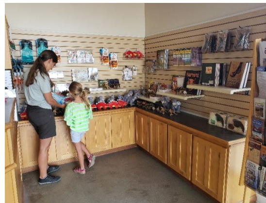
Figure 3 – JNM giftshop