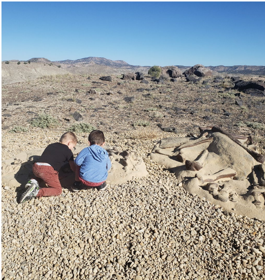
Figure 5 – Children Investigating Tactile Learning Equipment

The JNM is a popular destination for individuals of all ages visiting palaeontologic sites along the Dinosaur Diamond National Scenic Byway or for those who have a general interest in paleontology or geology. Visitation decreased by 15% compared to the previous year for a total of 3,817 individuals in 2022. We anticipate future visitation will increase as we continue to build our relationship with the local Utah State University Eastern Prehistoric Museum, increase our presence on social media, and as visitors post images of recent developments and leave positive reviews on popular websites.