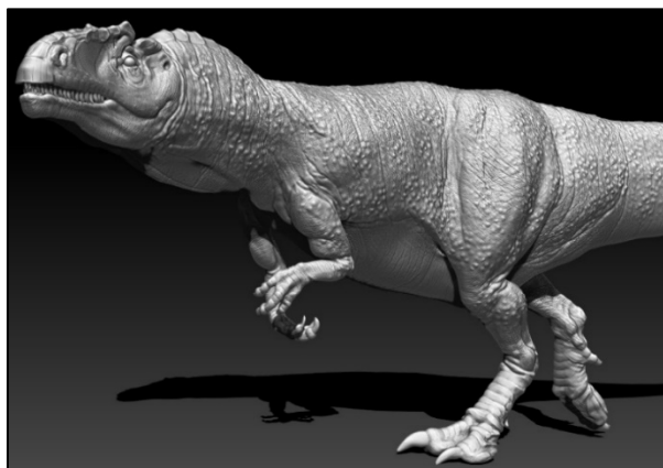
Figure 2- New Sculpture Design

In August, we established a giftshop in partnership with the Intermountain Natural History Association to enhance visitors' experiences at the monument. In the fall of 2022, we installed the foundations for three new dinosaur sculptures. Scheduled to be installed in FY2023, the sculptures will enhance visitor experiences and interpretation opportunities along our main hiking trail. Throughout the year, we continued planning and coordination with local partners, including the Utah State University Eastern Prehistoric Museum, regarding the preparation for the proposed quarry building replacement.