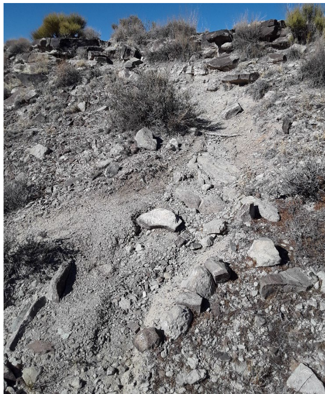
Figure 4 -Unstable portion of the Rock Walk Trail

The JNM has several challenges related to existing trails, interpretation, and staffing. It is unclear when the trail systems at the monument were developed, but many of the trails do not meet modern design standards to ensure they are safe, accessible, and resilient. There are many issues that make the current trail alignments unsustainable into the future. The condition of trails require extensive re-routes, modifications, and potential resurfacing to combat erosion and discourage off-route travel. In the Fall of 2022, we submitted a solicitation for a trail maintenance and construction contract. We are currently reviewing bids to provide the necessary trail maintenance and construction needs required to make our trails safe and sustainable. The contract will be awarded in FY 2023. Interpretation continues to be lacking outside the visitor center. The interpretive plan developed in 2021 was a great start to develop new interpretive information, but we are still working on finalizing the required edits and merging the content with the new BLM sign standards. Balancing staffing levels with the existing visitation levels continues to be challenging to ensure good visitor experience and appropriate use of funding.