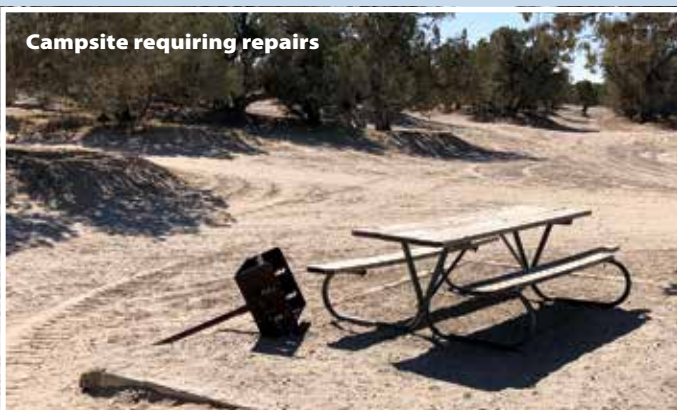
Campsite requiring repairs