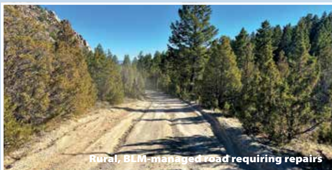
Rural, BLM-managed road requiring repairs

Recreational Values: Auto touring, backpacking, biking, birding, boating, camping, canoeing, environmental education, fishing, float trips, gold panning, hiking, historic sites, horseback riding, hunting, interpretive programs, kayaking, mountain biking, off-highway vehicle use, paddling, photography, picnicking, rafting, scenic viewing, snowmobiling, wedding events, wild and scenic river, wilderness, wildflower viewing, wildlife viewing