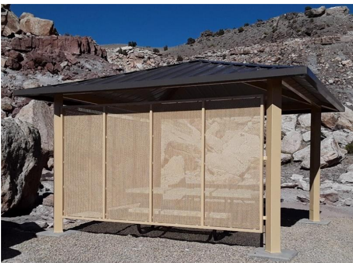
Figure 1 - New shade structure

The Jurassic National Monument (JNM) had many accomplishments this year. In the fall of 2020, employees worked on several new contracts and the results were implemented in 2021. Contracts included the installation of a new shade structure in the picnic area, the construction of a scientifically accurate and realistic ground form for the main allosaur exhibit in the visitor center, and the development of an interpretive plan along with 10 new interpretive panels. In the spring of 2021, staff completed the installation of four large outdoor pieces of tactile learning equipment for young visitors and the operations crew resurfaced a mile of the monument access road with additional gravel. During the summer of 2021, we hosted four American Conservation Experience interns that helped us staff the visitor center, complete trail maintenance, and create four interpretive videos associated with the monument. In the fall of 2021, we installed a new shade structure, completed the allosaur exhibit base, constructed a new connector trail on our interpretive hike, uploaded four new interpretive videos to the monument landing page (See: Jurassic National Monument Interpretive Videos ), and established a new contract for three lifelike dinosaur sculptures to be placed along our main interpretive hike in 2022. Several students and professors from the University of Wisconsin at Oshkosh and Indiana University of Pennsylvania returned to continue excavations and study the bone bed.