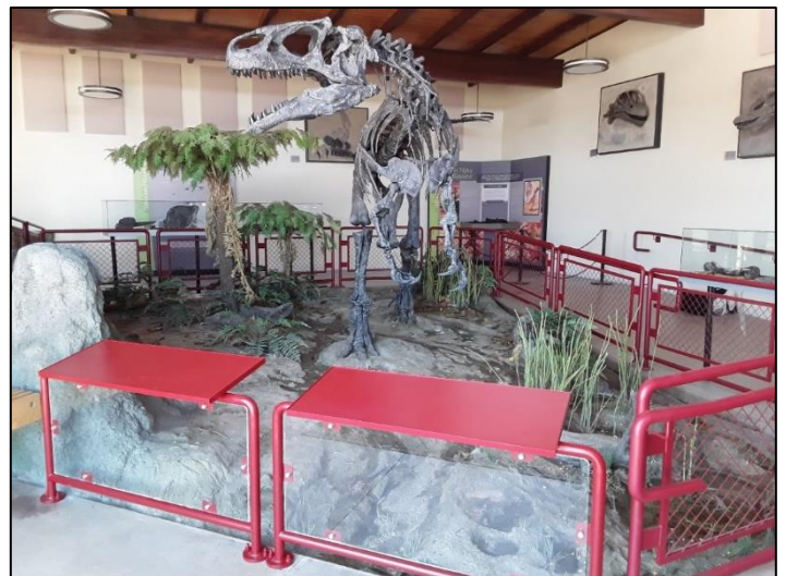
Figure 2 - New exhibit base