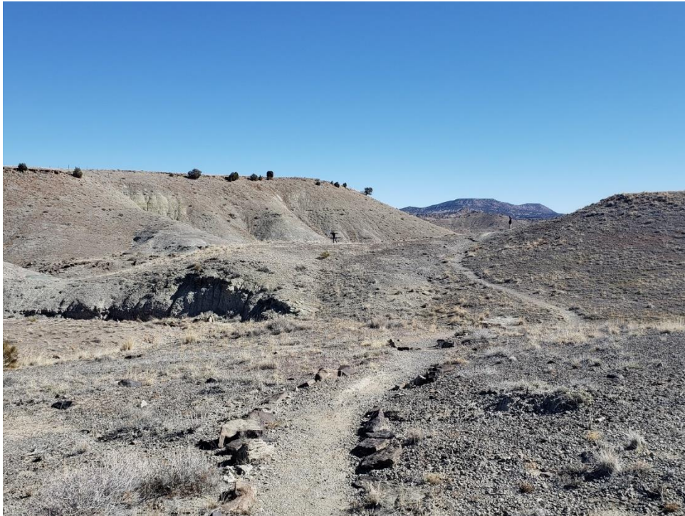
Figure 3 - Stable portion of the Rock Walk Trail

The Jurassic National Monument has several challenges related to existing trails, interpretation, and staffing. Many of the trail systems at the monument do not meet modern design standards to ensure they are safe and resilient. There are many issues that make the current trail alignments unsustainable into the future. The condition of trails require extensive reroutes, modifications, and potential resurfacing to combat erosion and discourage off route travel. The interpretive plan that was developed in 2021 is a great start to upgrade the current interpretive information, which is current lacking outside of the visitor center. Additionally, balancing the staffing levels and the existing visitation levels continues to be a challenge to ensure good visitor experience and appropriate use of funding.