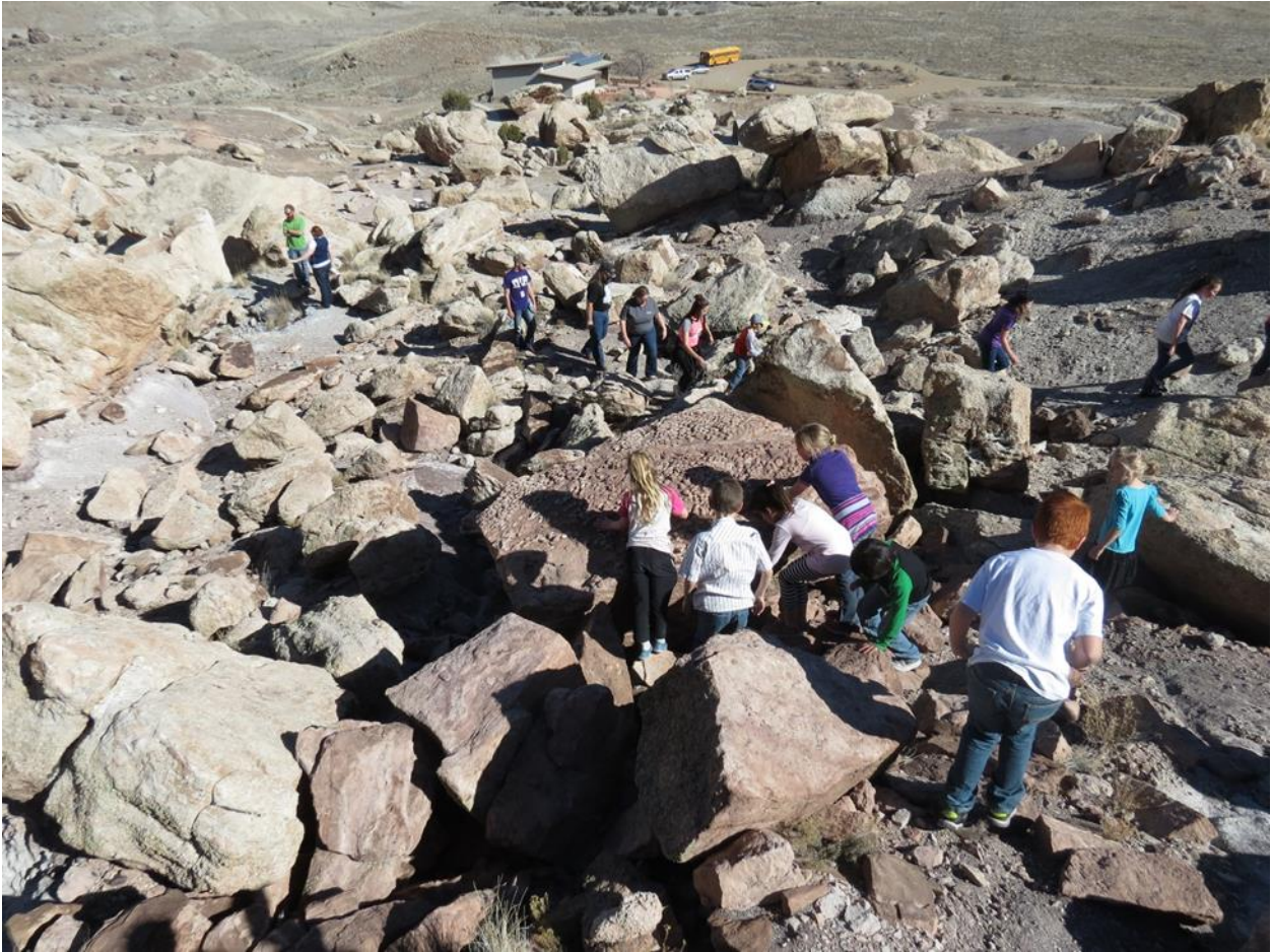
Figure 6 - Guided tour at JNM