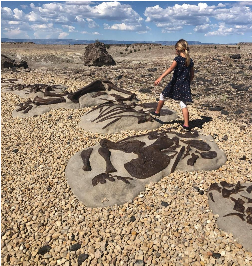
Figure 4 - New tactile learning equipment

The Jurassic National Monument is a popular destination for individuals of all ages visiting palaeontologic sites along the Dinosaur Diamond National Scenic Byway or those who have a general interest in paleontology or geology. Visitation increased over 1,100 individuals compared to the previous year for a total of 4,543 individuals in 2021. We anticipate visitation will continue to increase as we build the monument's presence on social media, and as visitors post images of recent visits.