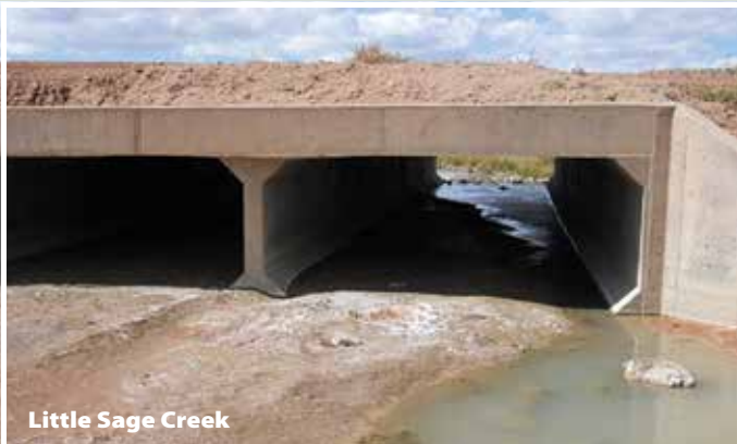
Little Sage Creek