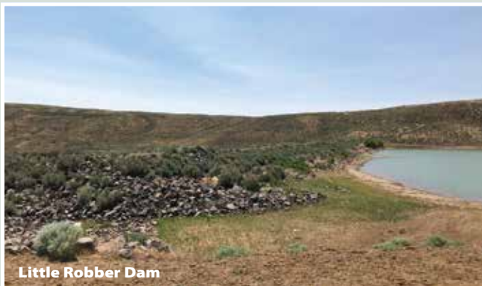
Little Robber Dam