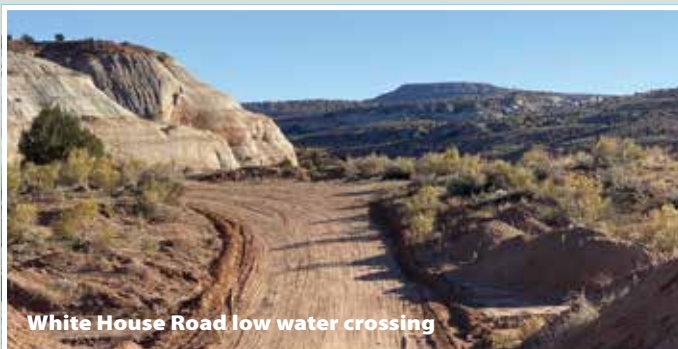
White House Road low water crossing