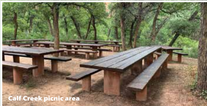
Calf Creek picnic area