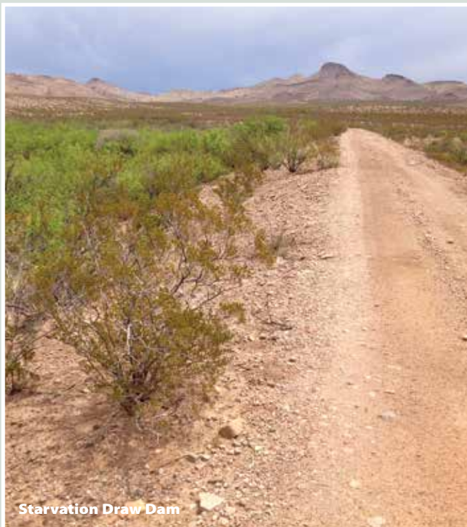
Starvation Draw Dam