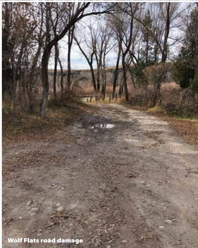
Wolf Flats road damage