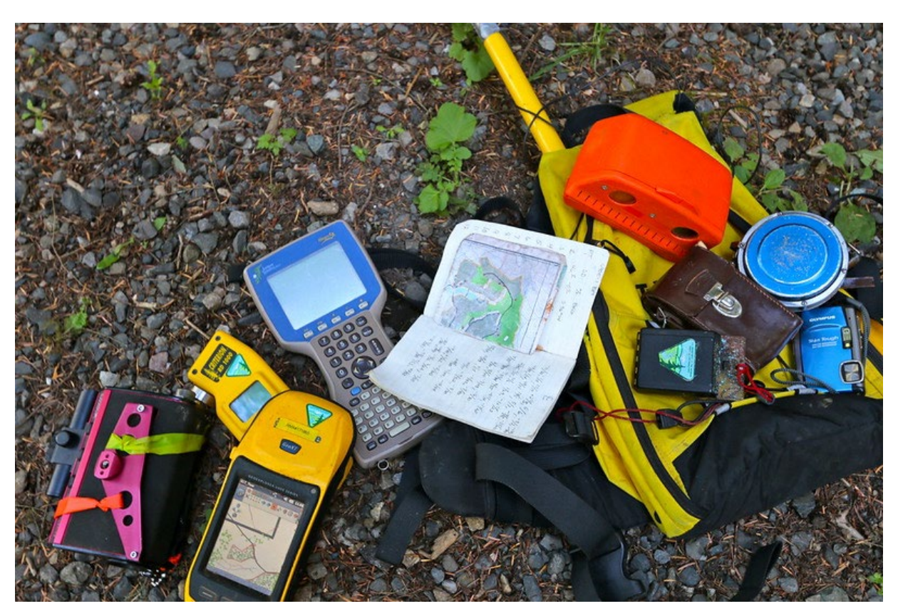
A picture of forestry equipment. July 11, 2014 at the Gordon Creek Timber Sale, BLM NW Oregon District.