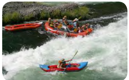
Wild and Scenic Rivers offer up the adventure of a lifetime.