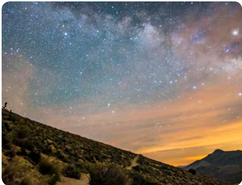
The Pacific Crest Trail features spectacular views – during the day and after dark.