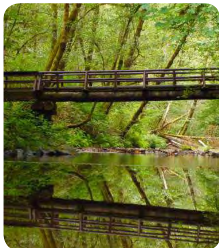
Experience the serenity of the Old Growth Ridge Trail.

Learn More: https://www.americantrails.org/nationalrecreationtrails/blm/Old-Growth-Ridge-Trail-BLM-Oregon.html