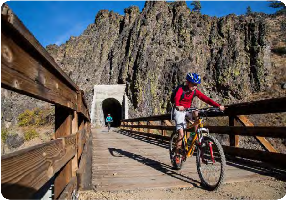
The whole family will have a blast riding the Bizz Johnson Trail.

toric Trails Interpretive Center in Casper, Wyoming and discover the stories of the Oregon, Mormon Pioneer, California, and Pony Express National Historic Trails.