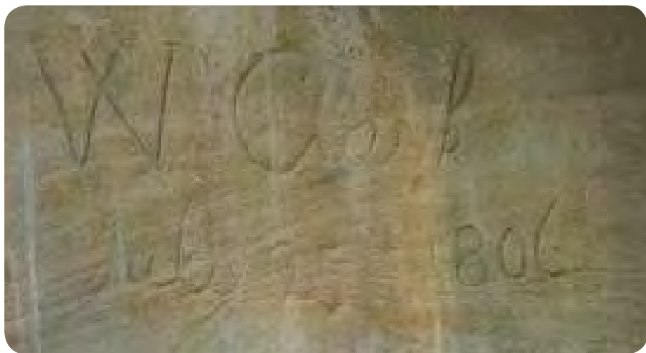
William Clark's signature is carved into the stone at Pompey's Pillar National Monument.

The BLM manages three recreation sites at Coeur d'Alene Lake Recreation Area, considered one of the most beautiful in the world. Mineral Ridge, a day use picnic site, serves as a trailhead for the 3.3-mile Mineral Ridge National Recreation Trail. This scenic trail, rising 700 feet in elevation, offers hikers a lofty overlook of the lake.