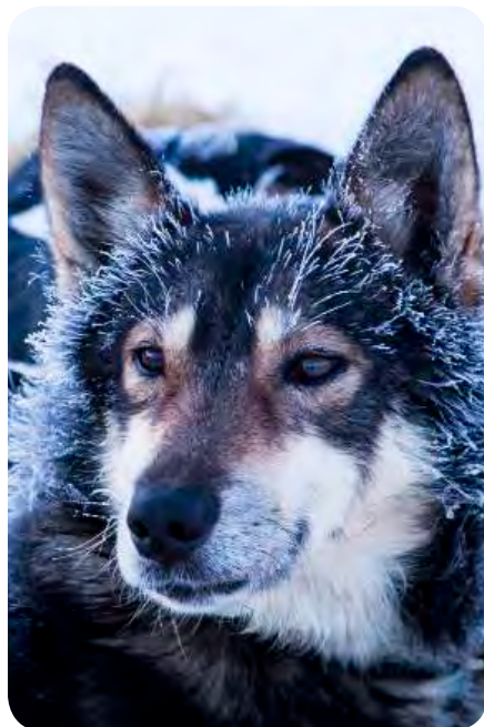
Each musher in the Iditarod, a race that began in 1973, uses a team of 16 dogs.

Learn More: https://www.blm.gov/visit/fortymile-river