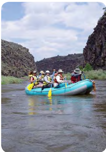
Get up close and personal with the waters of the Rio Grande.