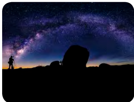
Don't put away your camera after the sunsets. Use long exposures to capture night skies.