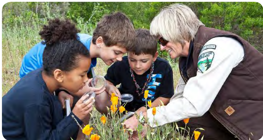
The BLM emphasizes interactive nature education for children of all ages.

Visitor centers are a valuable way to learn about an area. Certain BLM sites have visitor centers with interactive exhibits for kids and thrilling multimedia films. It's a fun way to explore the land before heading out. For more information, visit blm.gov .