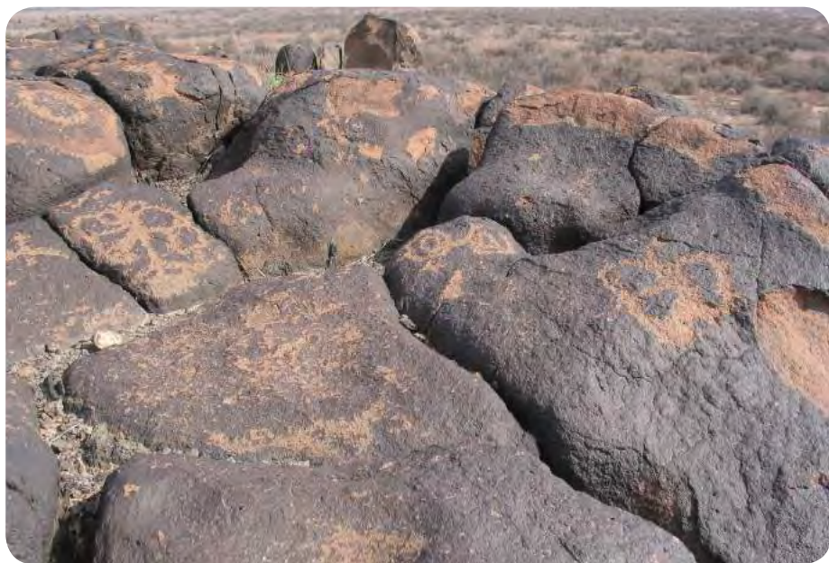
The Painted Rocks Petroglyph Site is located just off the Juan Bautista de Anza National Historic Trail.

the Grand Canyon and skirting the continent's harshest deserts. The trail takes its name from the Spanish colonies in northern New Mexico and southern California that were linked by this rugged route. The Spanish outpost of Santa Fe, New Mexico was founded in the early 1600s and the pueblo of Los Angeles, California was founded in 1781. But it was not until 1829 when Santa Fe merchant Antonio Armijo led 60 men and 100 pack mules northward on the trails blazed by native peoples that a suitable land passage between these colonies was established. Armijo's mules carried woolen goods for trade in California.