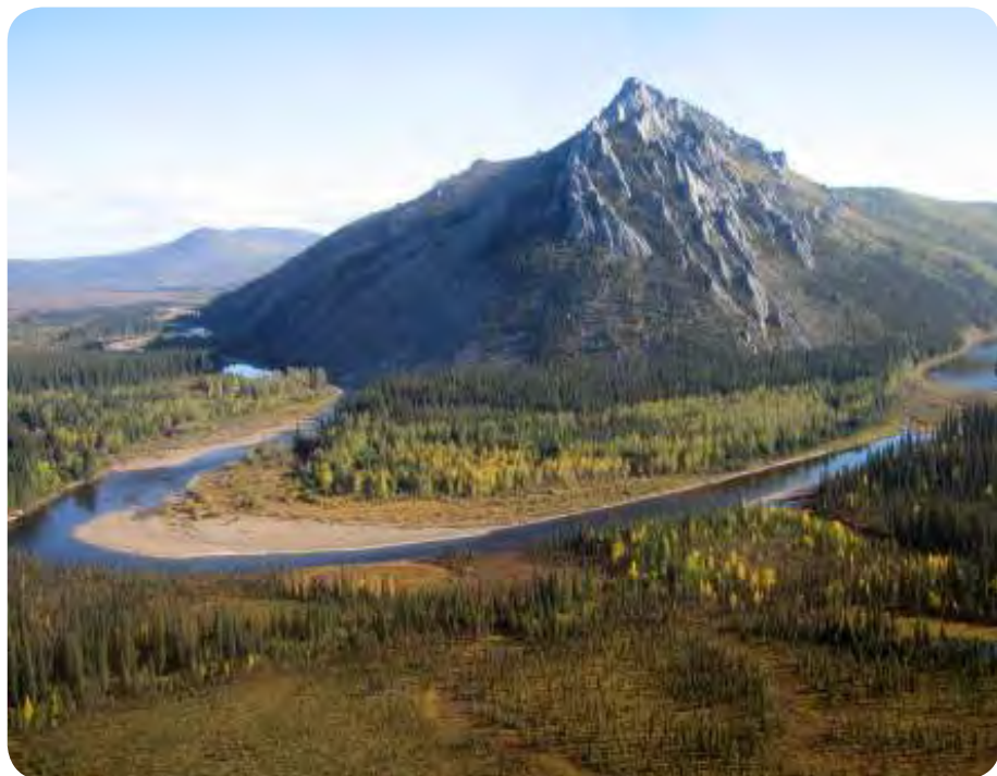
The calm, winding waters of Beaver Creek Wild and Scenic River offer a remote escape.

The most popular Gulkana River float trip begins at BLM's Paxson Lake Campground boat launch located at mp 175 of