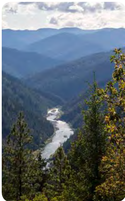
The Rogue River carves through rugged mountains on its way to the Pacific Ocean.

Learn More: https://www.blm.gov/programs/recreation/permits-and-passes/lotteries-and-permit-systems/oregon-washington/rogue-river