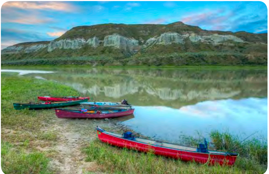
The Upper Missouri has something for boaters of all experience levels, from novices to experts.