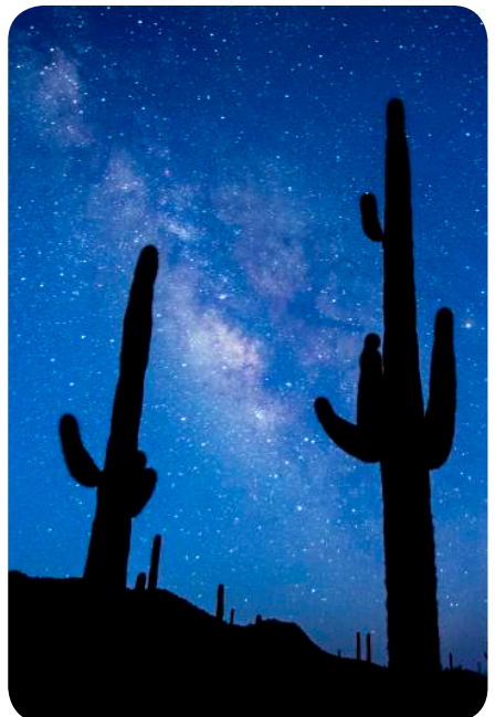
The Arizona National Scenic Trail has a little bit of everything that makes Arizona unique.