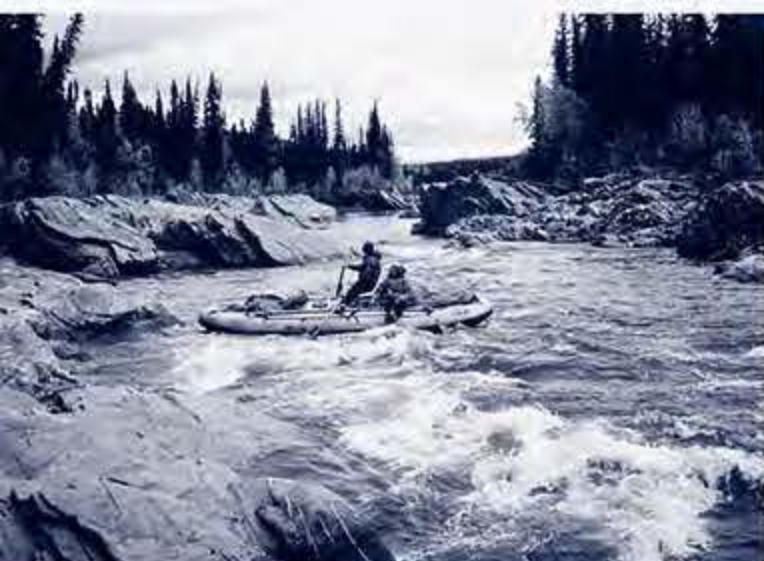
Rafters navigate through rapids on Birch Creek Wild and Scenic River.