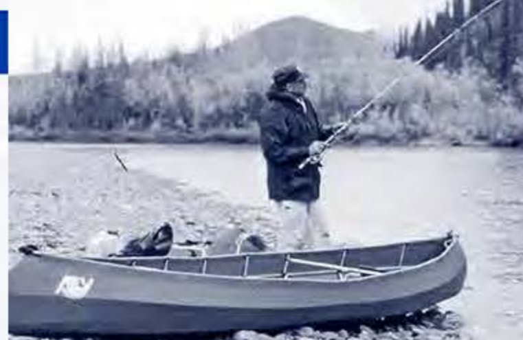
A canoeist stops to fish on Beaver Creek Wild and Scenic River.

We recommend you carry: • one or two good spare tires mounted on rims • tire jack and tool kit • emergency flares • extra gasoline, oil, and windshield cleaner • drinking water and food • emergency camping gear • first aid kit, insect repellent, and sun screen