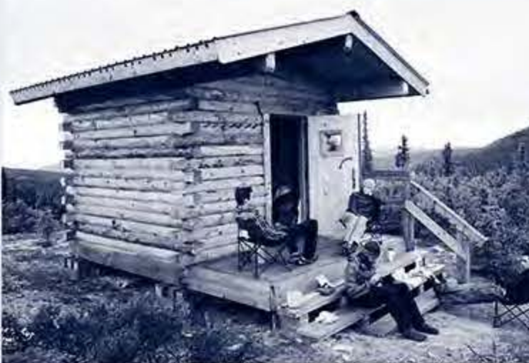
Hikers take a break at the BLM's Summit Trail Shelter in the White Mountains National Recreation Area.

Grapefruit Rocks Mile 39 (62.8 km) The large rock outcrops visible from the highway are a popular site for technical rock climbers. A short hike will bring you to the rocks. Turnouts are available for parking.