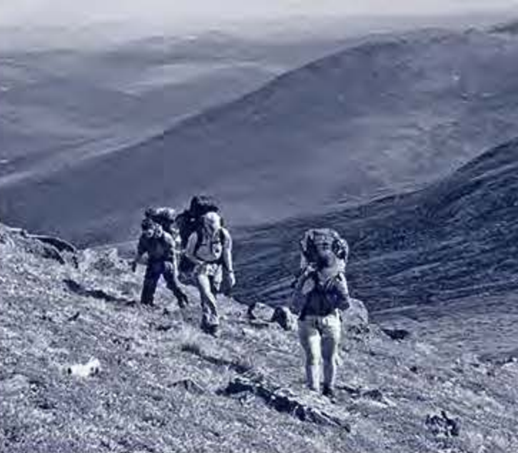
Hikers climb through tundra on the Pinnell Mountain National Recreation Trail.