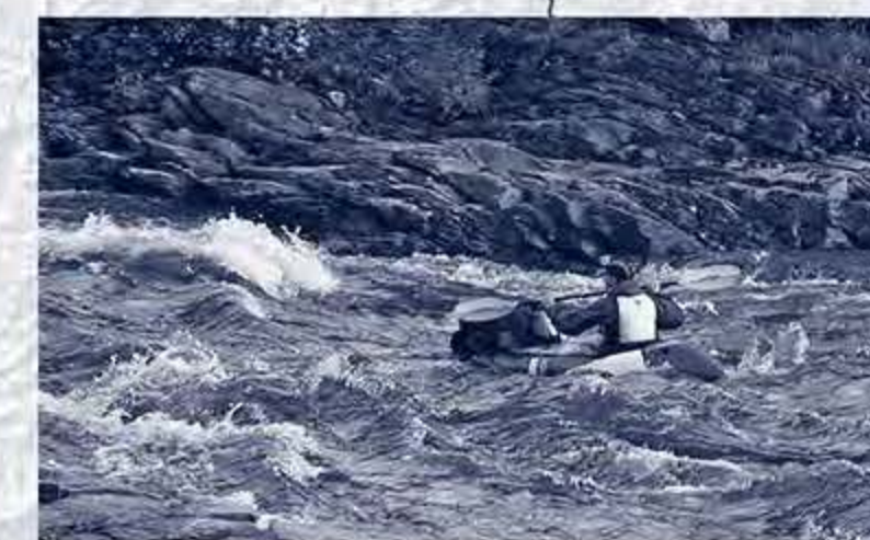
A packrafter runs a rapid on Birch Creek Wild and Scenic River.

The discovery of gold on Birch Creek led to the founding of Circle in 1893. Early residents thought the town was within the Arctic Circle, hence its name, but it is actually 50 miles south. It is also a Yukon Quest checkpoint.