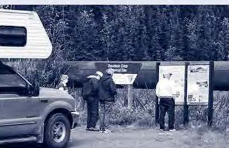
This siphon pipe at U.S. Creek (Mile 57.3) was part of the historic Davidson Ditch.

Access is provided to 200 miles of winter trails and public recreational use cabins in the 1-million-acre White Mountains National Recreation Area.