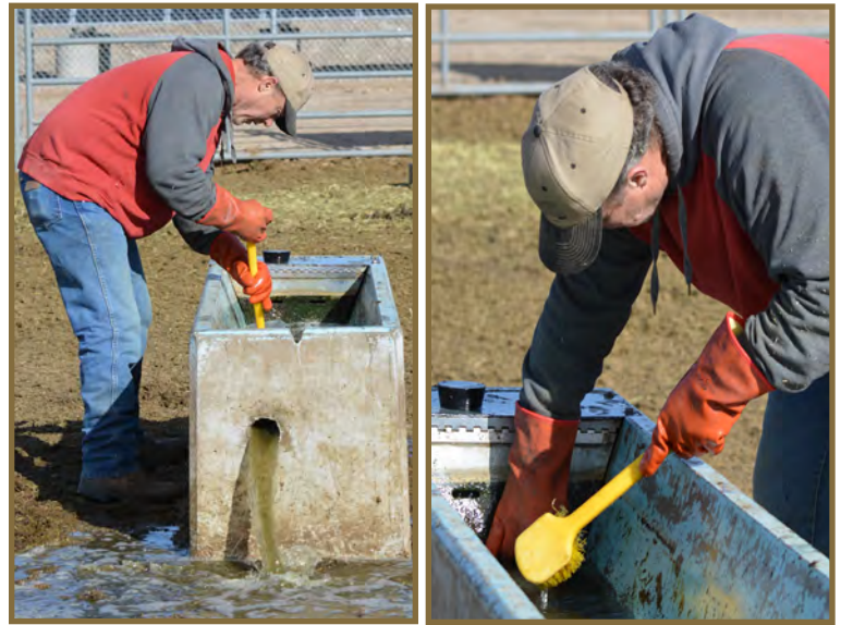
Daily Water Trough Check and Maintenance

The facility provides opening/closing information online, through news releases (which can also be found online) and with signage on the front gate, which provides a phone number to call for more information and to make tour or adoption appointments.