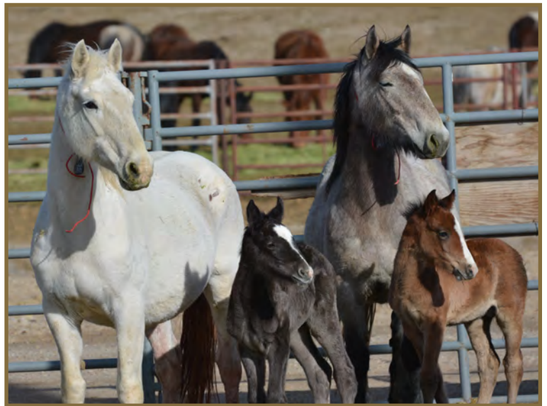
Healthy Mares and Foals