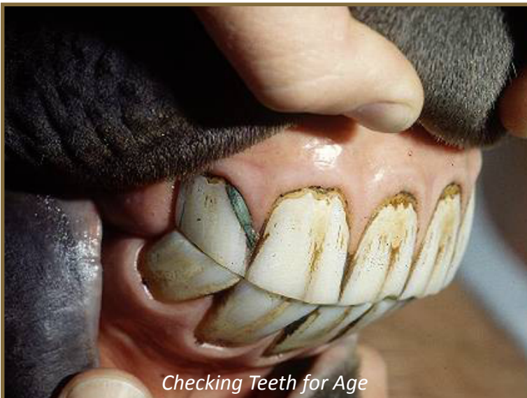
Checking Teeth for Age

The Bureau of Land Management (BLM) protects the health and welfare of wild horses and burros from the time they are on the range, through the gather and removal process and through the adoption or sale programs to when the animal is titled as an adopter's own animal.